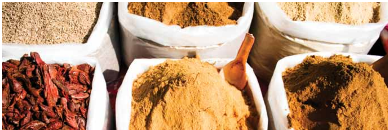
The right to food was one of the focuses of the Human Right Council Advisory Committee's 5 th session.

Four recommendations adopted. Mandate of the Committee in question