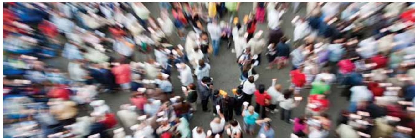
Pilgrims with candles in Lourdes, France.

New special procedures on freedom of association and women's equality